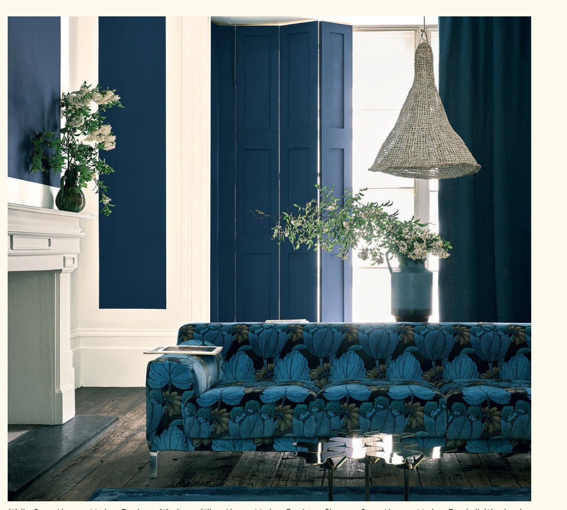
Walls: Serge No. 9919 Modern Emulsion, Wimborne White No. 239 Modern Emulsion; Shutters: Serge No. 9919 Modern Eggshell; Woodwork: Wimborne White No.239 Modern Eggshell; Fabric: Regency Tulip Lapis.

Colours Guide - Archive Liberty - UK/EU/ROW Version ©Farrow & Ball 2021 V1. All rights reserved.