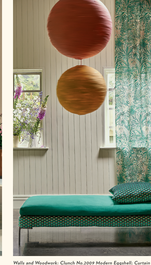
Fabric: Persian Voyage Jade Stone; Daybed Fabric: Lustre Linen Jade and Ottoman Spot Jade.