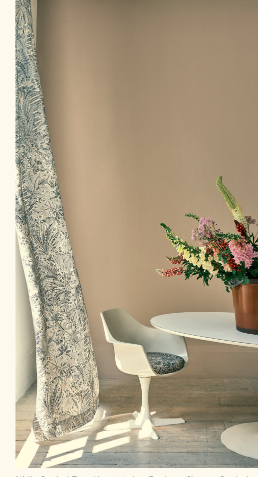
Walls: Smoked Trout No.60 Modern Emulsion; Skirting: Smoked Trout No.60 Modern Eggshell; Fabric: Persian Voyage Pewter.